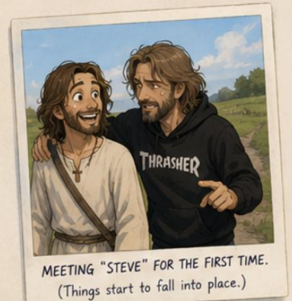
MEETING "STEVE" FOR THE FIRST TIME. (Things start to fall into place.)