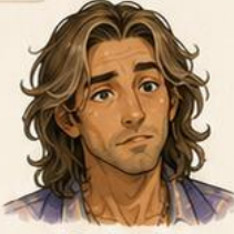
WAIT... DID GOD JUST TALK TO ME?