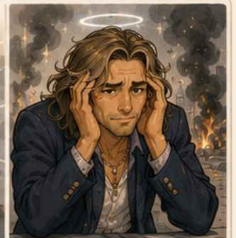
TAKING LAST MINUTE IMPACT (AGAIN)