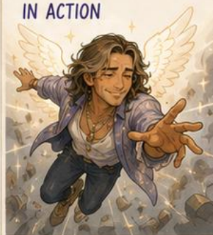
SAVING JESUS (AGAIN)