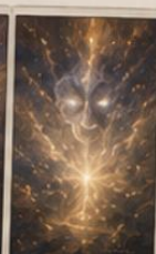
I TOLD YOU.