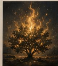
BURNING BUSH MEETING