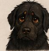
PLEASE LOVE ME