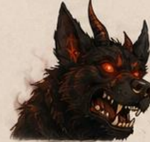
POSSESSED (Satan speaking)