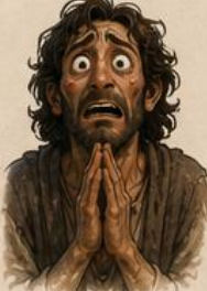
PLEASE, NOT MORE...