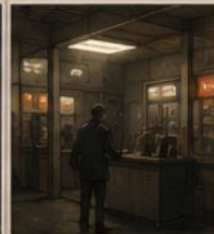
RANDOM GUY IN A GAS STATION