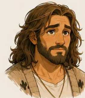
...YOU'RE NOT SO BAD.