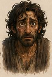
WHAT HAVE I DONE?