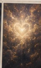
THAT'S MY BOY.