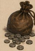
THIRTY PIECES OF SILVER