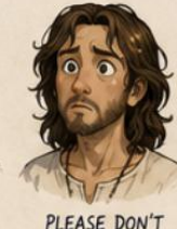
PLEASE DON'T BE MAD