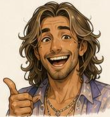
PLAN? WHAT PLAN?