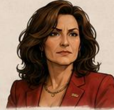
THE MASK SLIPS (year five)