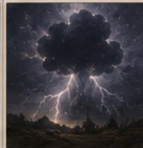
LOUD THUNDER MEETING