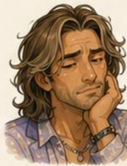
I HATE IT HERE.