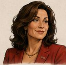
CHARMING & CALM