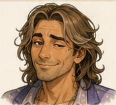
I GOT THIS.