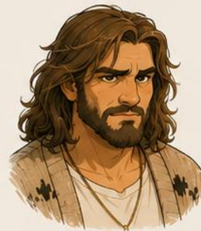
LET'S FIX SOME HISTORY.