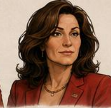
CONCERNED (not for you)